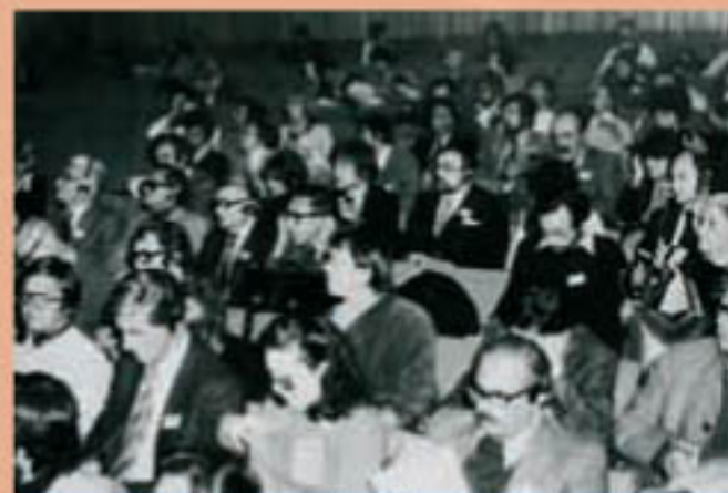
Caracas 1980: Plenary session of conference/General Assembly.