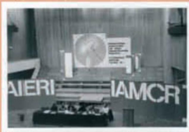
Warsaw 1978: General Assembly.

The next conference was held in Warsaw, 4-8 September 1978, with the general theme "Mass Media and Culture". Its attendance once more surpassed the preceding conferences: nearly 500 participants from 38 countries. At that time the overall membership of IAMCR was already in the region of 1,000 from over fifty countries. While the membership kept growing, special interest groups became more organized. One of these was a Marxist or "Materialist theory" approach in communication research, which was first convened as an informal group at the Leicester conference and was approved in the Warsaw General Assembly, after heated debate, as a Section called "Political Economy".